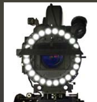
▲ Fig 2 - Gekko kisslite

Gekko was assisted by the introduction of warm white LEDs in 2003 and by increasing LED efficiency, reaching 113 lumens per watt in 2006. Distribution agreements with France, Germany and India were signed and, in October 2005, we sold the first two kisslite spin-offs: lenslite and george. In March 2006, we began designing our first colour luminaires.