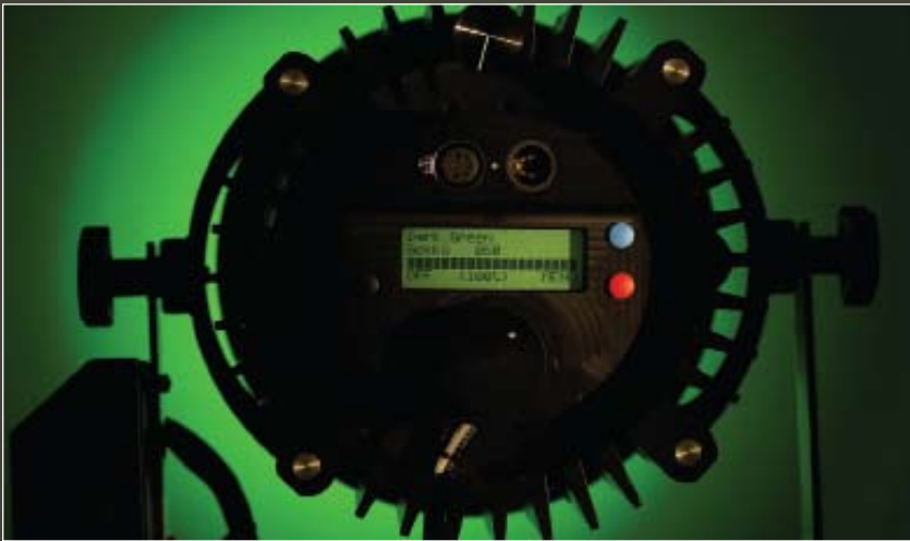
▲ Fig 3 - Gekko kedo colour head (set to dark green)