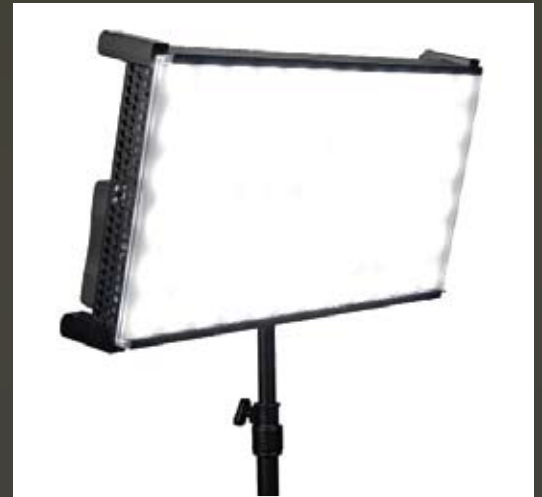
▲ Fig 4 - Gekko karesslite

dimming level to produce the amount of light required. Five minutes before you go live, the lamp is turned on and it starts instantly at the pre-set dimmed level. The light is very cool and has a negligible effect on the ambient temperature. Even if it is left on for 20 minutes in a tiny room, it won't heat the room up, and the look is flattering.