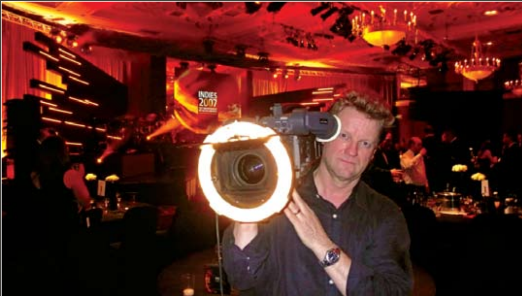
▲ Gekko kisslite at work